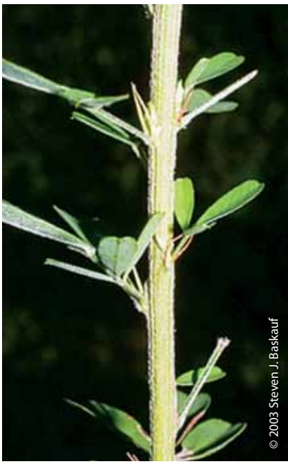
Each stem may produce a thousand seeds, which can remain viable for 20 years or longer.