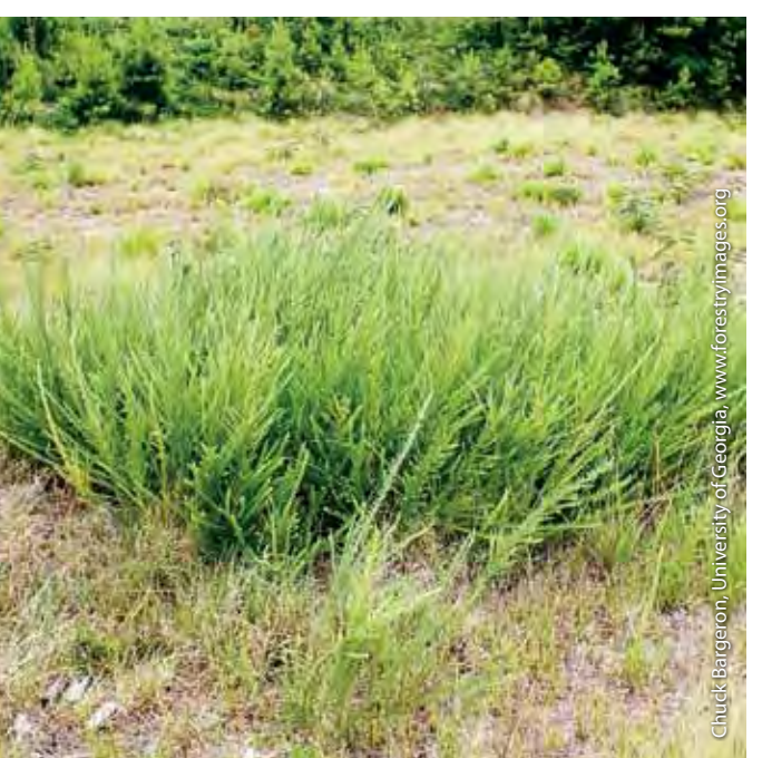
Sericea has a deep tap root allowing it to out-compete native plants, especially in times of drought.