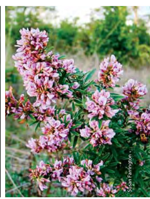
The native slender lespedeza, which is often mistaken for sericea, has purple flowers and is not found in large stands.